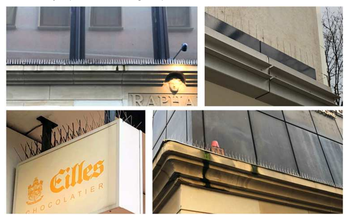
Step 4 Immediately replace the damaged spike before the birds move in.